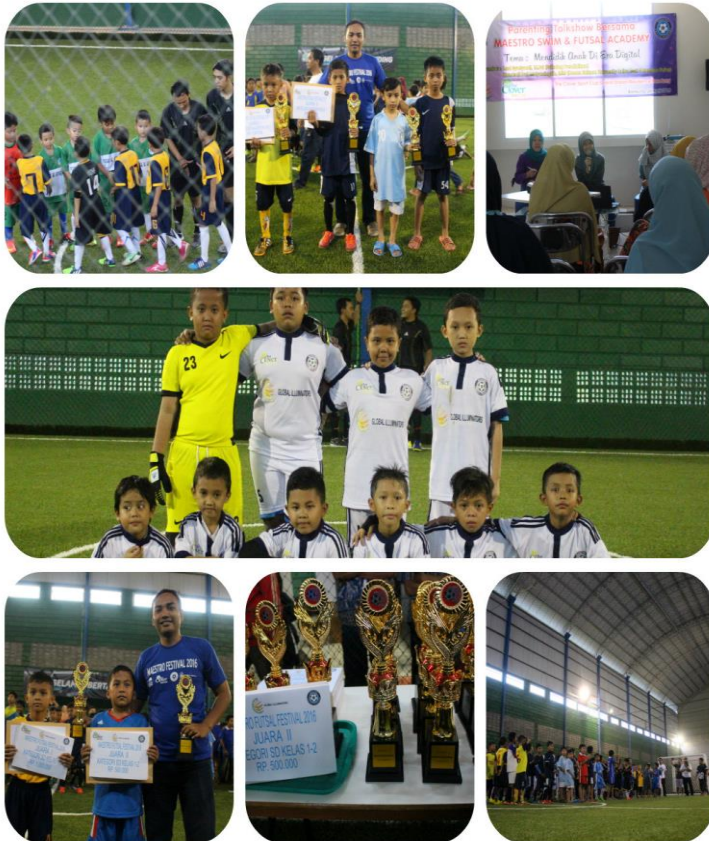
Global Illuminators Malaysia Team conducted its Latest CSR activity at Rumah Charis, Kuala Lumpur, Malaysia Children Home